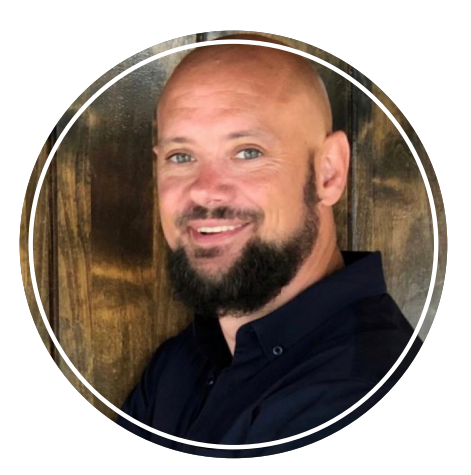
June Webinar Topic: Al and Automatic Processes at a Dental Practice Presented by: Pedro Becker